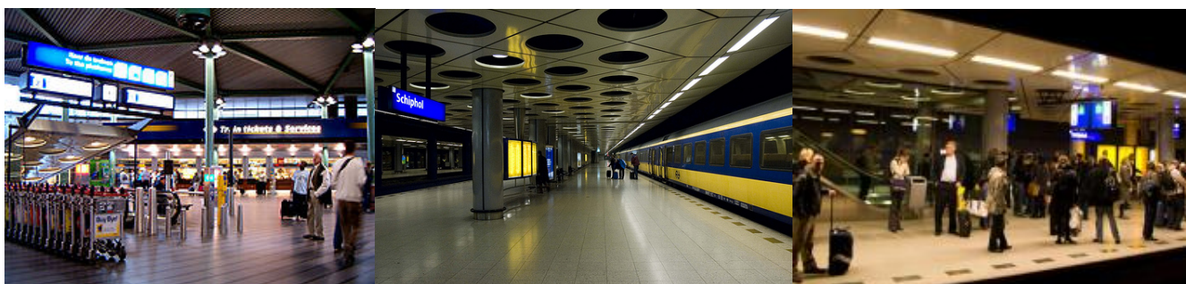
Hall of Schiphol railway station and underground platforms.

Most European airlines have several flights a day to and from Schiphol, Amsterdam Airport. If you want to travel fast and cheap, book a flight with Easy Jet ( www.easyjet.com ) from London, Liverpool, Belfast, Edinburgh, Glasgow, Barcelona, Geneva or Nice. Other cheap airlines are Ryan air and Berlin air.