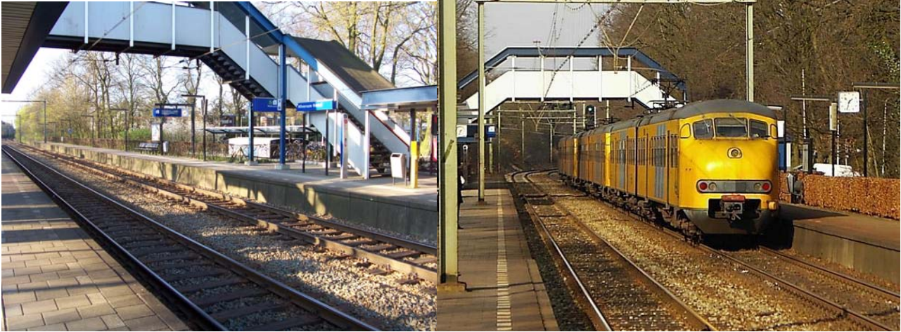
Hilversum-Noord Railway station.